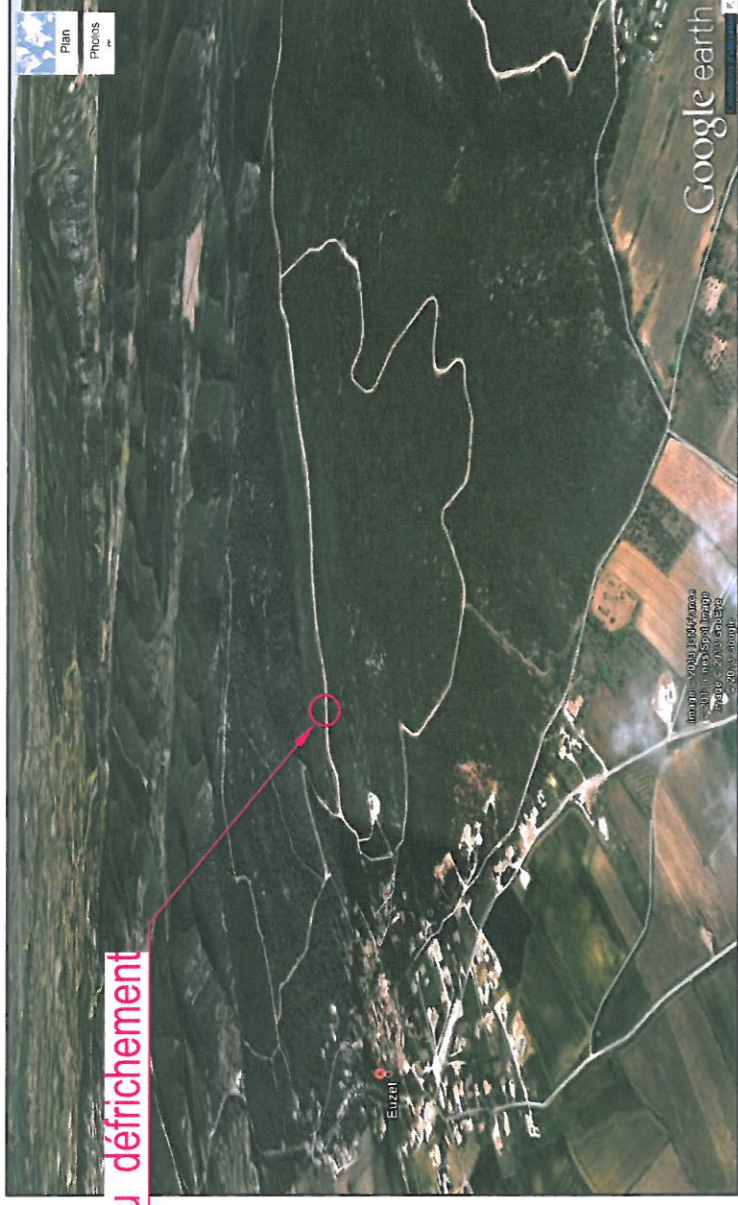
Emplacement du défrichement