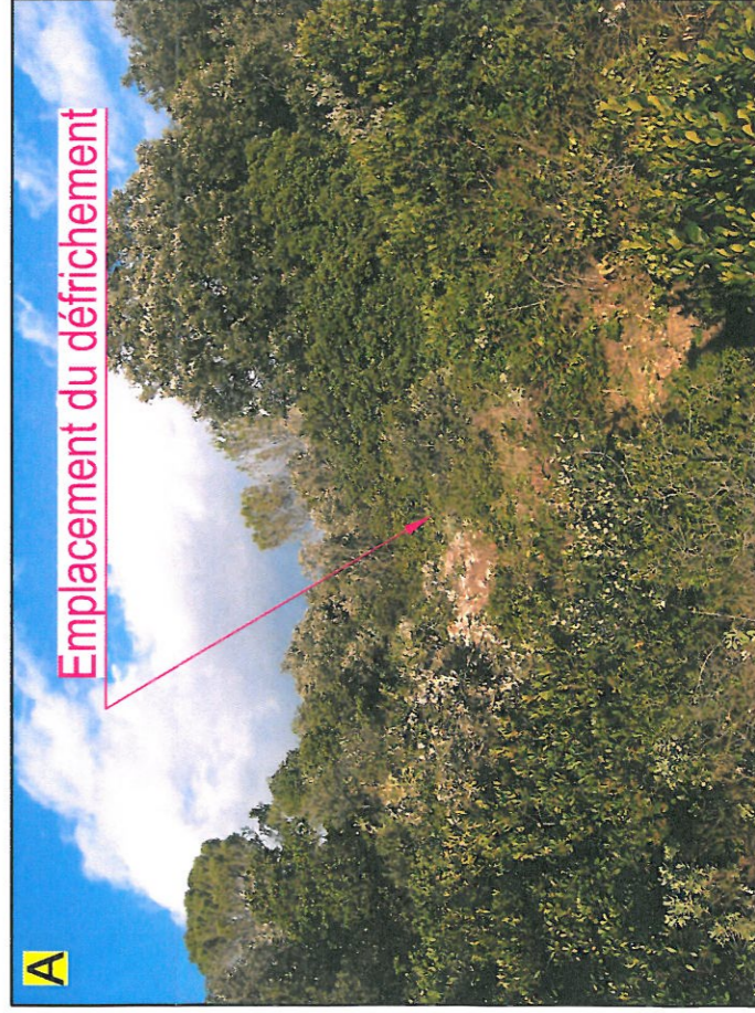
Date de prise: 05-12-2012